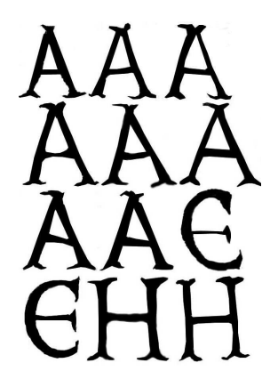
Figure 1. Digital Drawing.