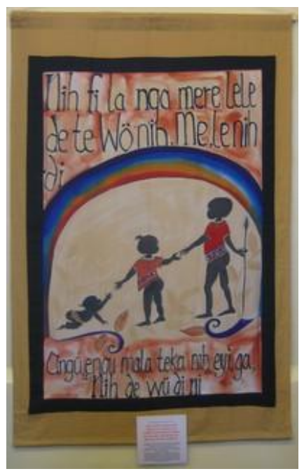
The banner for Aba