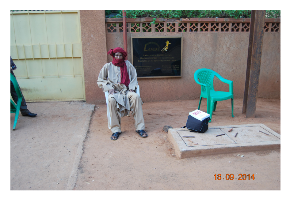
Figure 6: A Tuareg wearing a jalabia ensemble and the turban in Niamey on 18/09/2014.

to their dance and camel racing skills, but also their jalabia ensemble . Dressed in the jalabia and the turban, the youths smoothly moved with their camels toward the girls gathered around the tende . Men targeted the girl singing surrounded by several others applauding. The goal of the men was to profit from the inattention of the others in order to steal the headscarf of the girl singing, called the tamazagh (or tamawayt ). The one who succeeded in stealing this headscarf, called the alacho , was followed by other competitors. Succeeding and not succeeding in collecting back this alacho had equal symbolic value. They all contributed to creating a sense of honor as a true man ( ahalis wan tidit ) among peers. This distinction could increase one's social charm in peoples' eyes. The jalabia and the turban illustrated Mohamed's and Mossa's interpretations of what makes up an "authentic Tuareg": the capacity to embody past dressing habits in the present. This marks a difference between Mossa and other free-born Tuareg, who wear jeans and T-shirts.