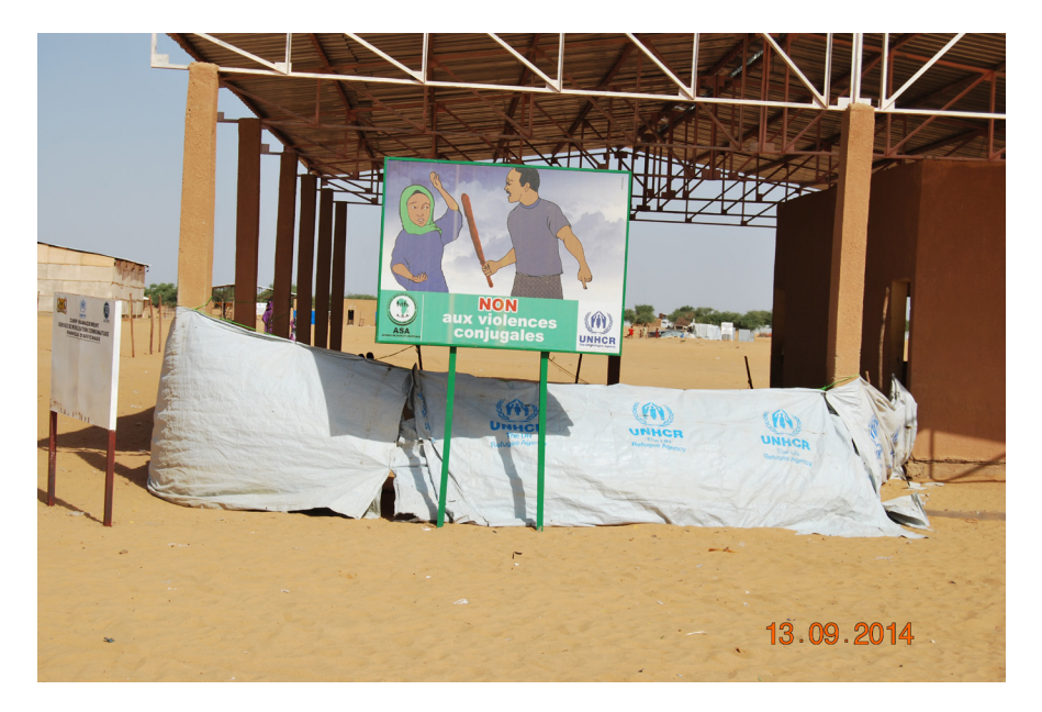
Figure 3: As part of the sensitization campaign launched in December 2012, the UNHCR had put this picture in every quartier to remind men that domestic violence is forbidden in the camp. Photograph by S. Diallo on 13/09/2014 in Abala.

give up such practices, at least in this camp. We will not let you violate your wives in this camp here. ^{47}