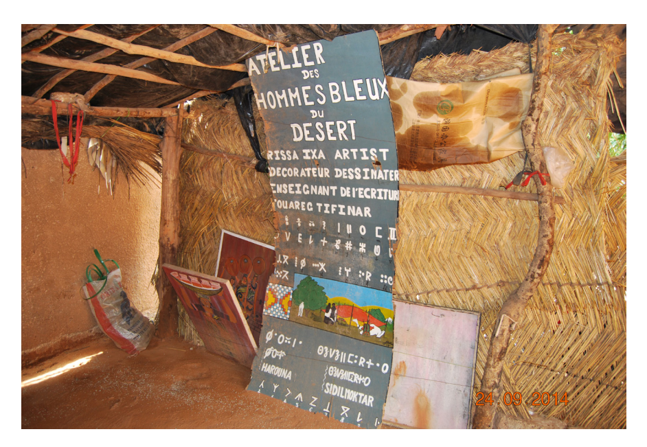
Figure 4: The board with descriptions of Rissa Ag Issa's activities on 24/09/2014.