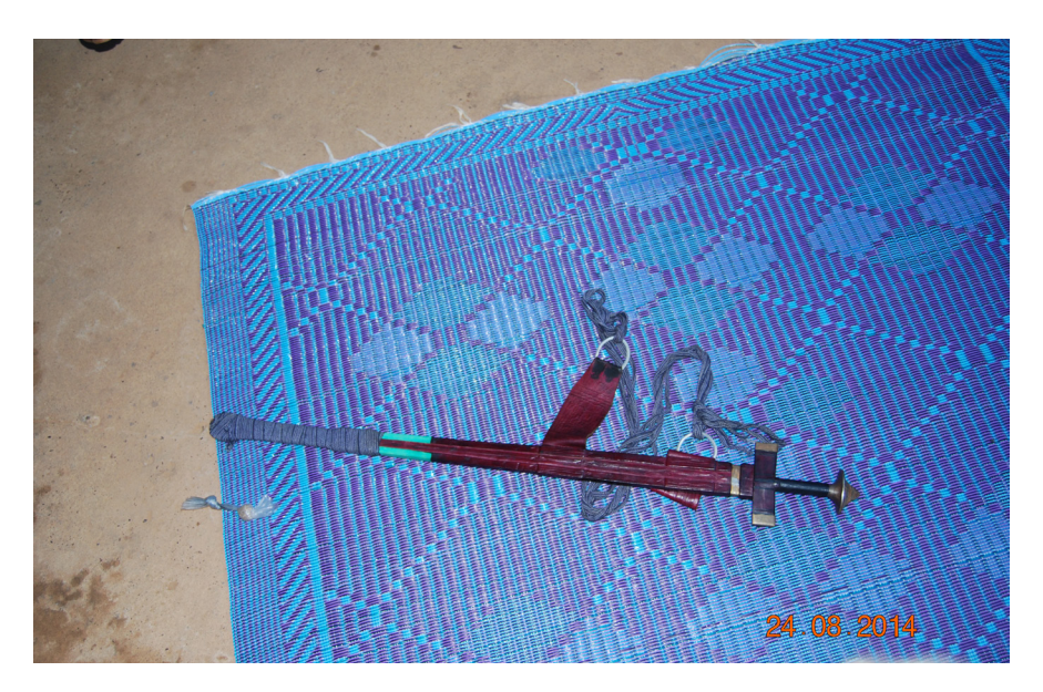
Figure 7: Mossa's sword on 24/08/2014.

who regularly attack people during nights. Before I got this sword, I did not have anything to protect my family members with. This is what makes me a man (the narrator showing the sword).<sup>19</sup>