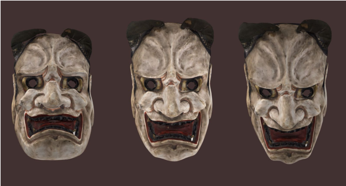
Picture 2: Screenshots of the 3d model of a Hannya mask from Kompakkt.