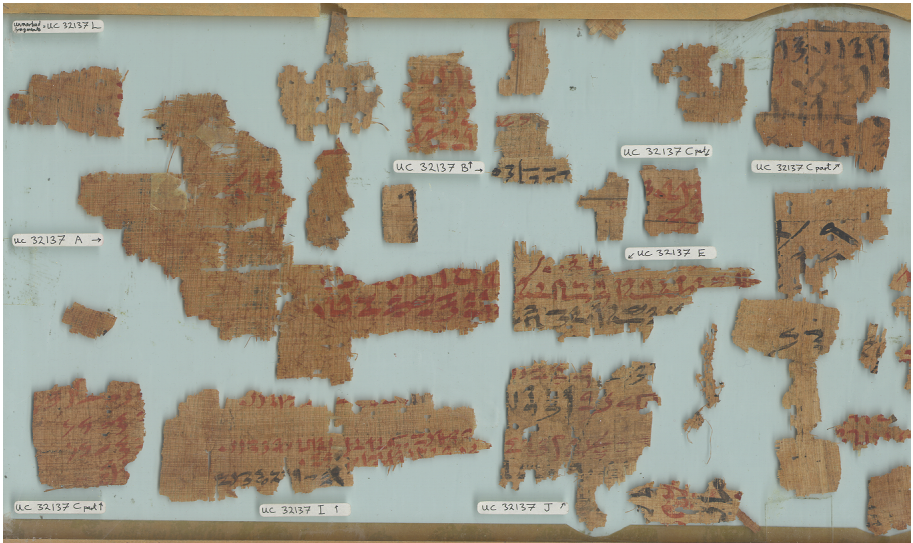
Figure 1. Lahun papyrus fragments UC32137I with angular handwriting (before 1850 BC), and UC32171J, with rounded handwriting (after 1850 BC).

No new writing equipment is available to explain the change in the reverse direction, from angular to rounded, in the aesthetic of writing practice during the nineteenth century BC. In the Lahun temple accounts, angular signs give way to rounded remarkably abruptly, in the decade preceding the reign of king Amenemhat III, about 1850 BC (Luft 21). 5 At the same time, the material as well as the verbal culture of Egypt underwent major changes in every area, leading Egyptologists now to distinguish sharply between a late and an early Middle Kingdom. The inclusion of handwriting in this cultural revolution calls for particular investigation.